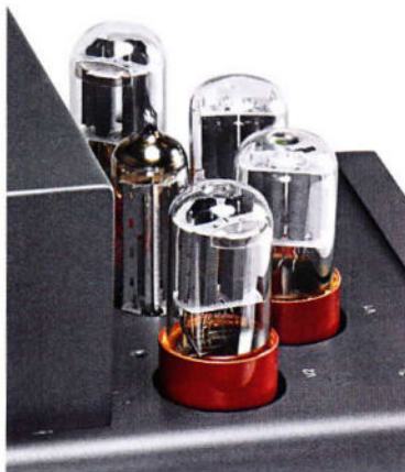
Quad uses pairs of 6SL7 and 6SN7 valves alongside an EZ81 rectifier.