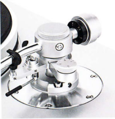
A calibrated counterweight applies downforce and a rotary dial sets outward bias.

hope at the price – no faffing around with belts here. Each speed can be adjusted individually, using front mounted rotary controls. To help in this process Luxmn fit an internally illuminated stroboscope that shines at markings on the platter. Unfortunately, it wasn't very bright and in a room filled with sunlight I could barely see what the markings were doing through the small viewing window. At lower light levels the display was dull but visible; the markings become stationary when speed is set correctly. Although usable the Lux display wasn't as eye catching as either my Garrard or a Technics Direct Drive – slightly disappointing as these things visually enliven a turntable. You do get a cueing light, however.