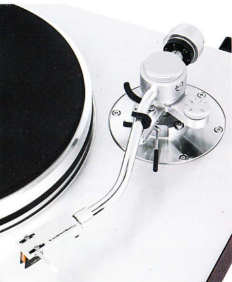
We used an Ortofon Cadenza Bronze MC cartridge for review purposes.

Inside the plinth lies a newly developed high torque a.c.