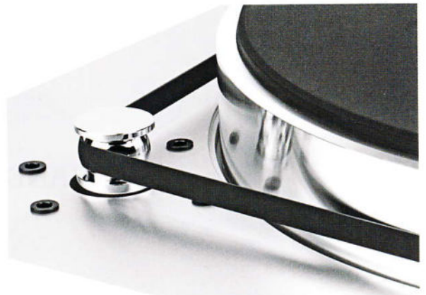
A d.c. servo motor with single step pulley drives a belt that loops around the outside edge of the platter.

The arm follows classic 1970s Japanese design principles, although some may argue most of these were originally devised by SME on the 3009 of the 1960s. It is S shaped, has a detachable headshell and calibrated rotary counterweight. Arms of old like this would ring like a tubular