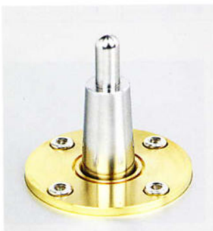
A large brass bodied main bearing supports the platter.

Which brings me to Mozart violin concertos on a 180gm LP