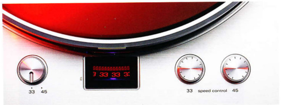
Two speeds, independent speed adjusters and stroboscope markings, visible through a small window. Speed is adjusted so the markings appear stationary.

is 4gms-12gms, which covers most. A heavier counterweight is available, but there are very few cartridges around weighing more than 12gms. Bias is set by turning a calibrated dial.