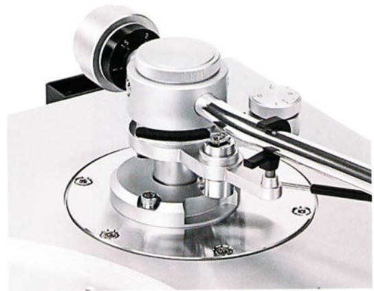
The Luxman arm bolts onto the turntable and is removable. A version without arm is available.

from 2L of Norway. Here the Luxman shone. It was this LP that confirmed its character, Marianne Thorsen's violin coming over as sweet natured, lush with detail and vibrant in nature. There was superb resolution of tonal colour here, the timbral properties of the violin – and indeed that of the backing strings – being obvious. I wondered why anyone would ever criticise LP for its rendering of classical